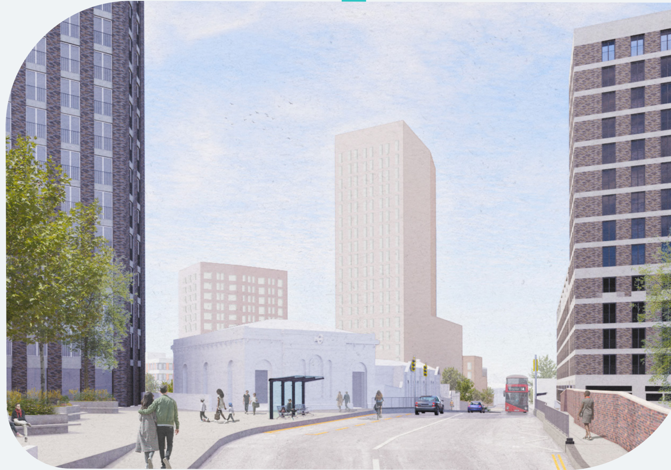
How the scheme could look from the station