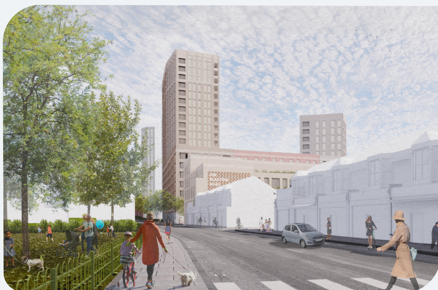
How the proposals could look from Plaistow Road

Plaistow Place will bring a number of new facilities where residents can live, learn, shop, work, eat and drink.